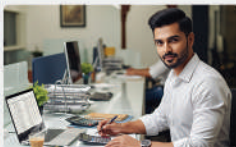
Marketing, Revenue & Financial Management