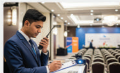
MICE Events & Hotel Operations