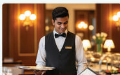
Food & Beverage Service Executive