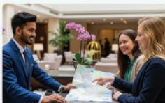
Introduction to Hospitality & Tourism