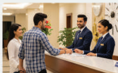
Front Office & Accommodation Operations