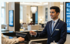
Front Office Executive