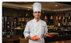
Food & Beverage (F&B) Management